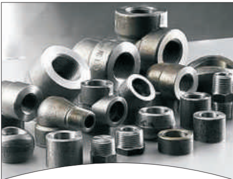
Forged / Screwed Fittings

High Nickel Alloys : Monel, Nickel, Inconel, Hastalloy, Titanium, Tantalum, Bismuth, High Speed Steel, Zinc, Lead etc.