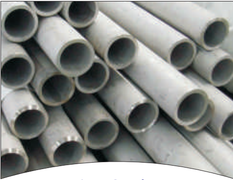
Pipes & Tubes